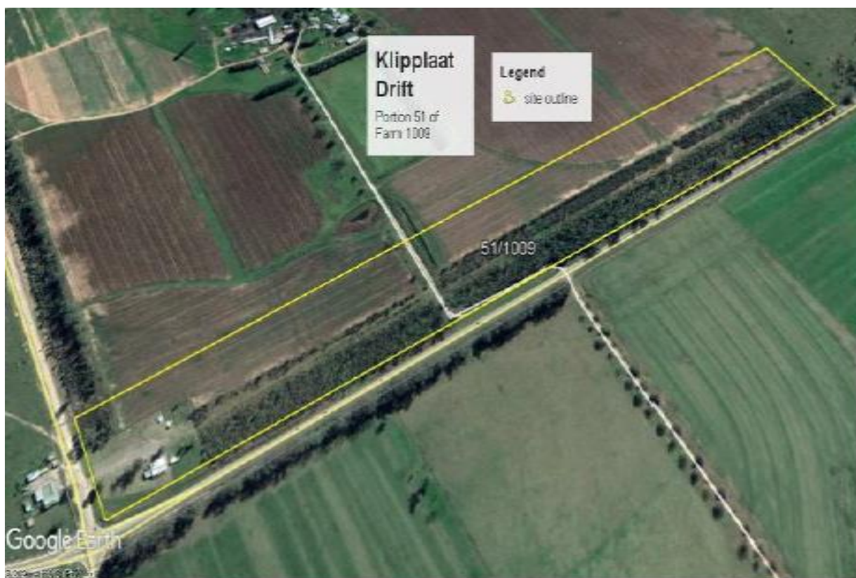
Figure 1: Google Earth map of the site for the proposed Wembezi Shopping Centre (yellow outline) on Portion 51 of Farm Klipplaat Drift 1009, Estcourt.