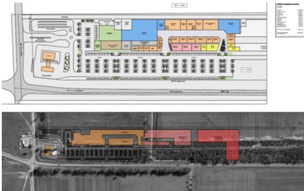
Figure 2: Details of proposed Wembezi shopping centre on Farm Klipplaat Drift 1009.