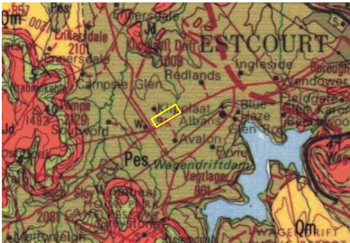
Figure 3: Geological map of the area around the Farm Klipplaar Drift. The location of the proposed project is indicated within the yellow rectangle. Abbreviations of the rock types are explained in Table 2. Map enlarged from the Geological Survey 1: 250 000 map 2928 Drakensberg.