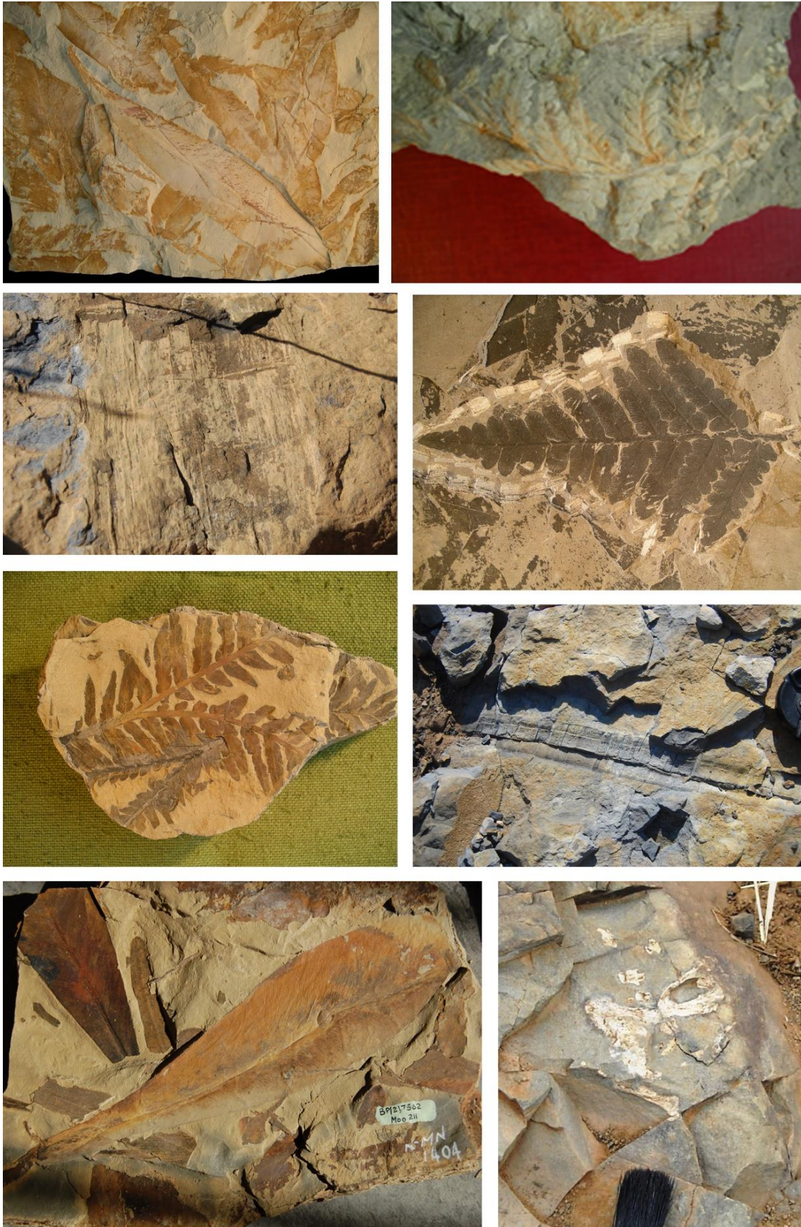
Figure 5: Examples of fossil plant impressions from the Glossopteris flora, Vryheid Formation. Bottom right shows a bone found in situ.